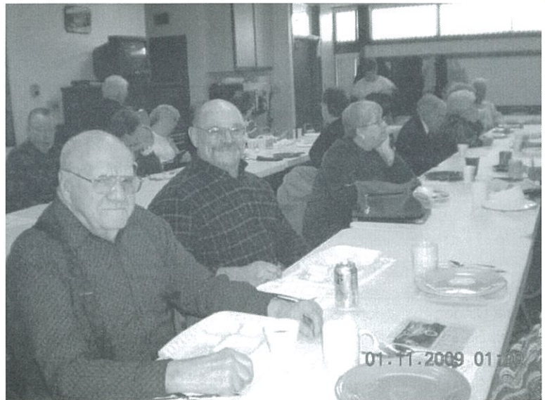
Members of Lincoln Chapter AHSGR attend the Annual Meeting held on January 11.

"Officers shall be elected annually and serve for one (1) year or more if no other